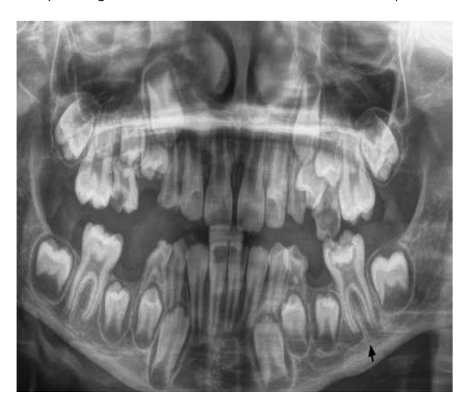
Figure 2. Pre-treatment panoramic roentgenogram

Dental caries is the most common cause of pulp necrosis (2). Restorable tooth is usually treated by endodontist. Some cases may undergo crown restoration. Other causes of pulp necrosis include trauma and periodontal infections. Depending on being acute or chronic pulp necrosis, the lesion may remain in the alveolar bone or drain intra-orally or extraorally through cutaneous structures. In acute cases, patients