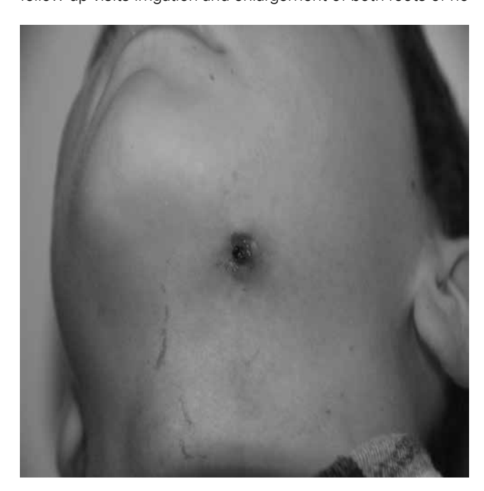
Figure 1. Sinus tract opening under the chin

36 tooth had been continued untill the endodontic treatment has been completed (Figure 4).